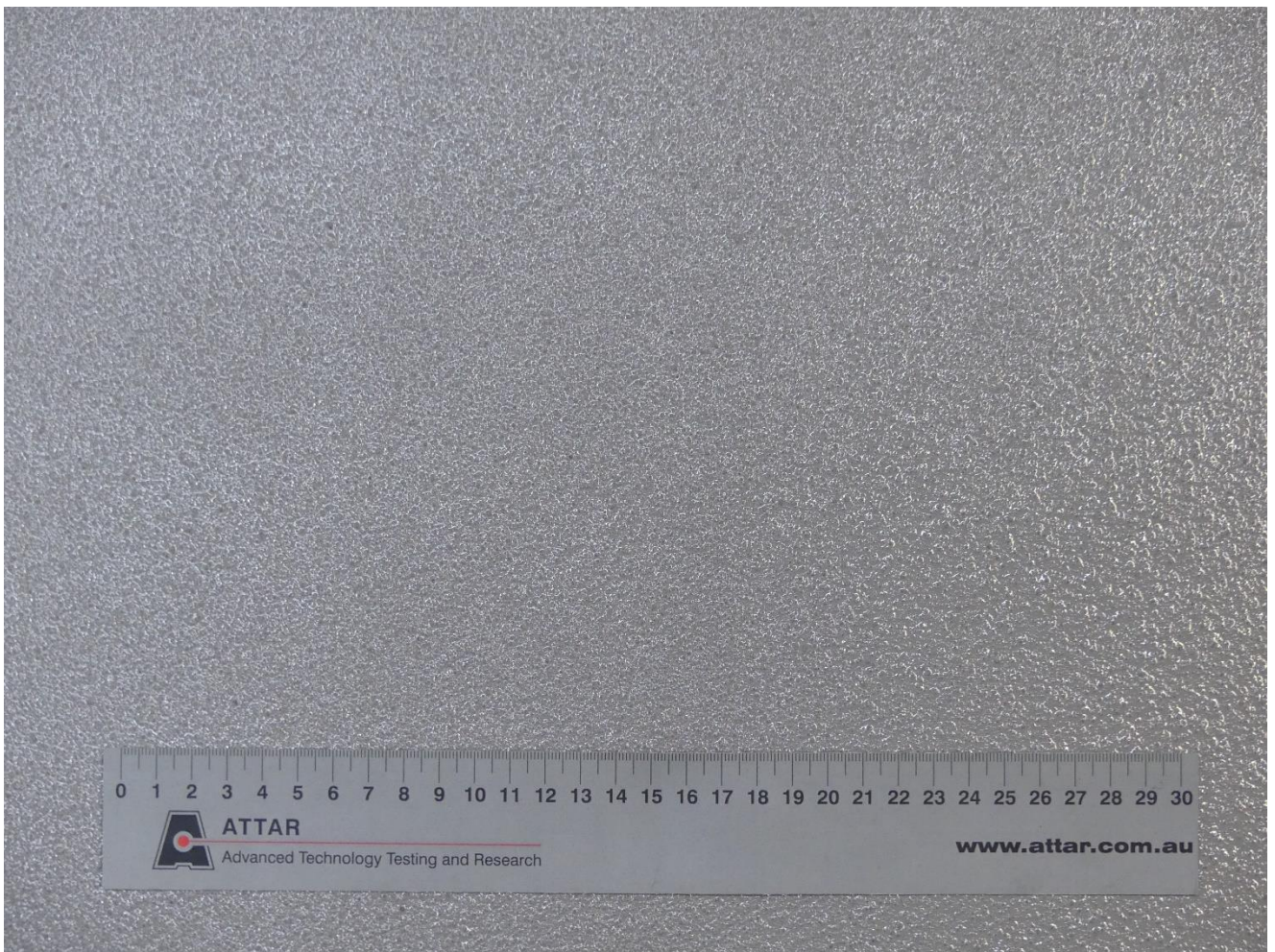
Figure 1: Fosroc Nitoflor FC150 HP-FC + Fosroc Nitoflor Anti-Slip Grains 02 Silica Sand 30/60# + Fosroc Nitoflor FC150 HP-FC.