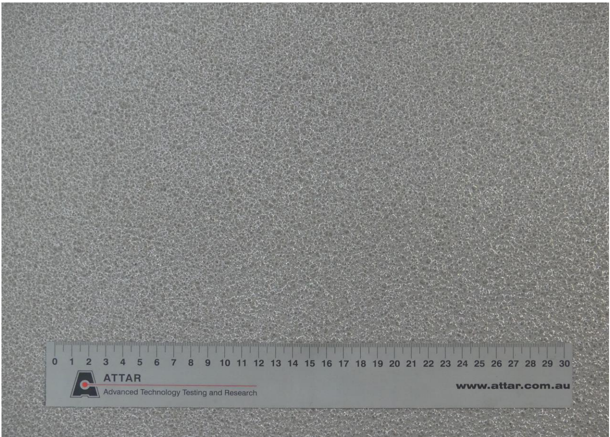
Figure 1: Fosroc Nitoflor FC150 HP + Fosroc Nitoflor Anti-Slip Grains 01 Silica Sand 16/30# + Fosroc Nitoflor FC150 HP