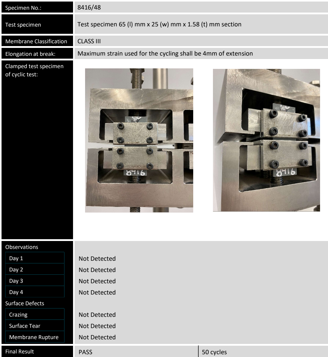
TABLE 5 TEST SAMPLE HOLING DURING CYCLIC MOVEMENT AND TEST RESULTS

The performance criteria set out in AS4654.1:2012, Table A3 and section B4, pass or fail criteria by observing any cracking, rupture or necking of more than 1 mm down from original width.