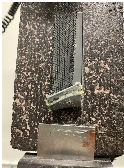
FIGURE 4 IMAGES OF TEST SAMPLE PERFORMING ADHESION-IN-PEEL