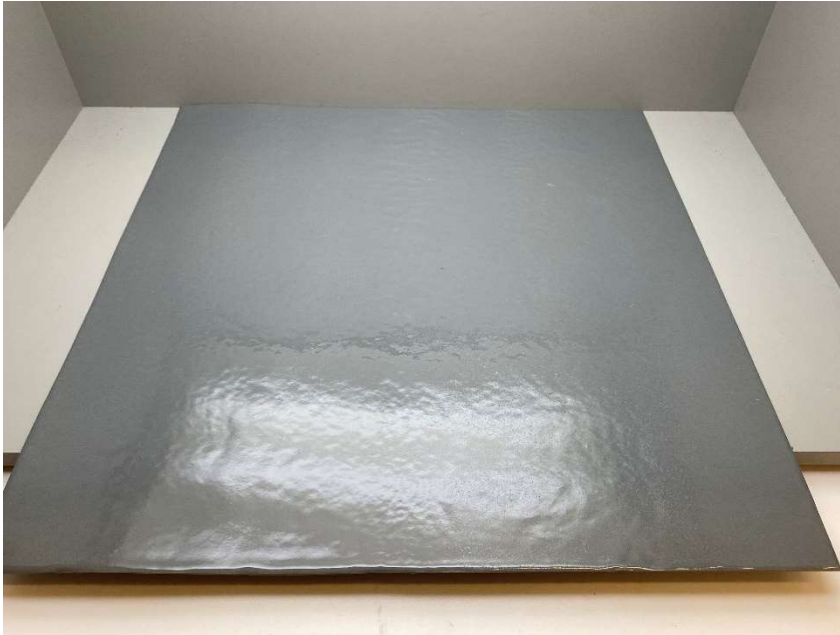
FIGURE 1 TOP FACE OF POLYUREA WHE110

The supplied specimen for assessment is shown below in Figures 1 and 2.