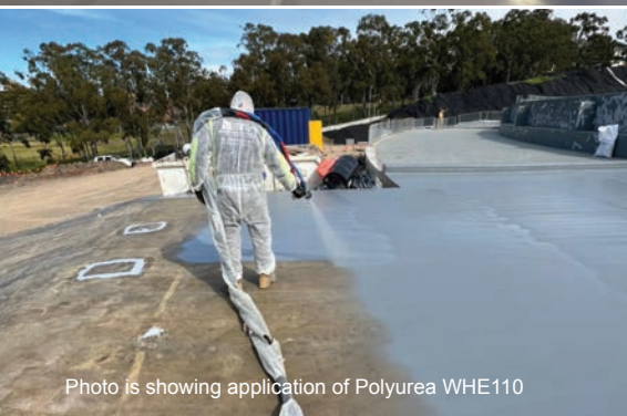
Photo is showing application of Polyurea WHE110

Serious waterproofing protection was required for the roof and plant room floors at this new community facility. Super efficient and tough, Polyurea WHE110 was the right choice for above ground and under foot.