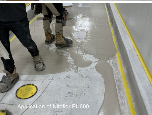
Application of Nitoflor PU600